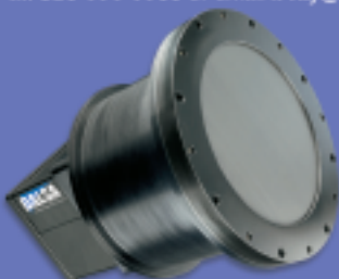
DALSA's Cougar 6M3 X-ray camera : megapixel resolution, high speed and high dynamic range for digital x-ray applications in industry.

Contact a DALSA Imaging Sales Professional at: 520-791-7700 or email x-ray@dalsa.com